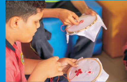
Needle & Thread Work